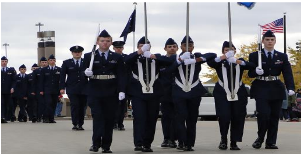
On November 9 th , our squadron marched in Milwaukee's 50 th annual Veterans Day Parade. Timmerman Comp. Sqdn. marched with us.