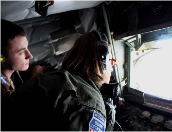
A refueling flight with the 128 th ARW on June 22 nd .

Flights are a regular part of the Cadet Program and are designed to give relatable experience to the cadet in the cockpit. Our cadets flew orientation flights in CAP aircraft at Summer Encampment, Aerospace Education Weekend and our Orientation Flight Day. Our efforts garnered the Aerospace Education Excellence Award.